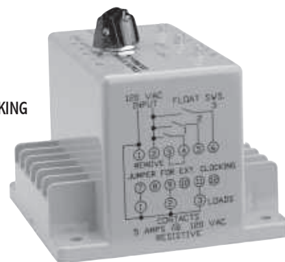
Triplexor Alternating Relay