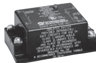
Single Channel Isolated Switch

Process Control Equipment for Hazardous Locations 7M26 UL913