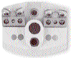
1018A Single Terminal Block (2 Terminals) Order 1018A