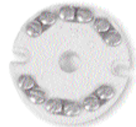
1018C Triplex Terminal Block (6 Terminals) Order 1018C