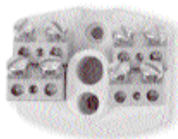
1018B Duplex Terminal Block (4 Terminals) Order 1018B